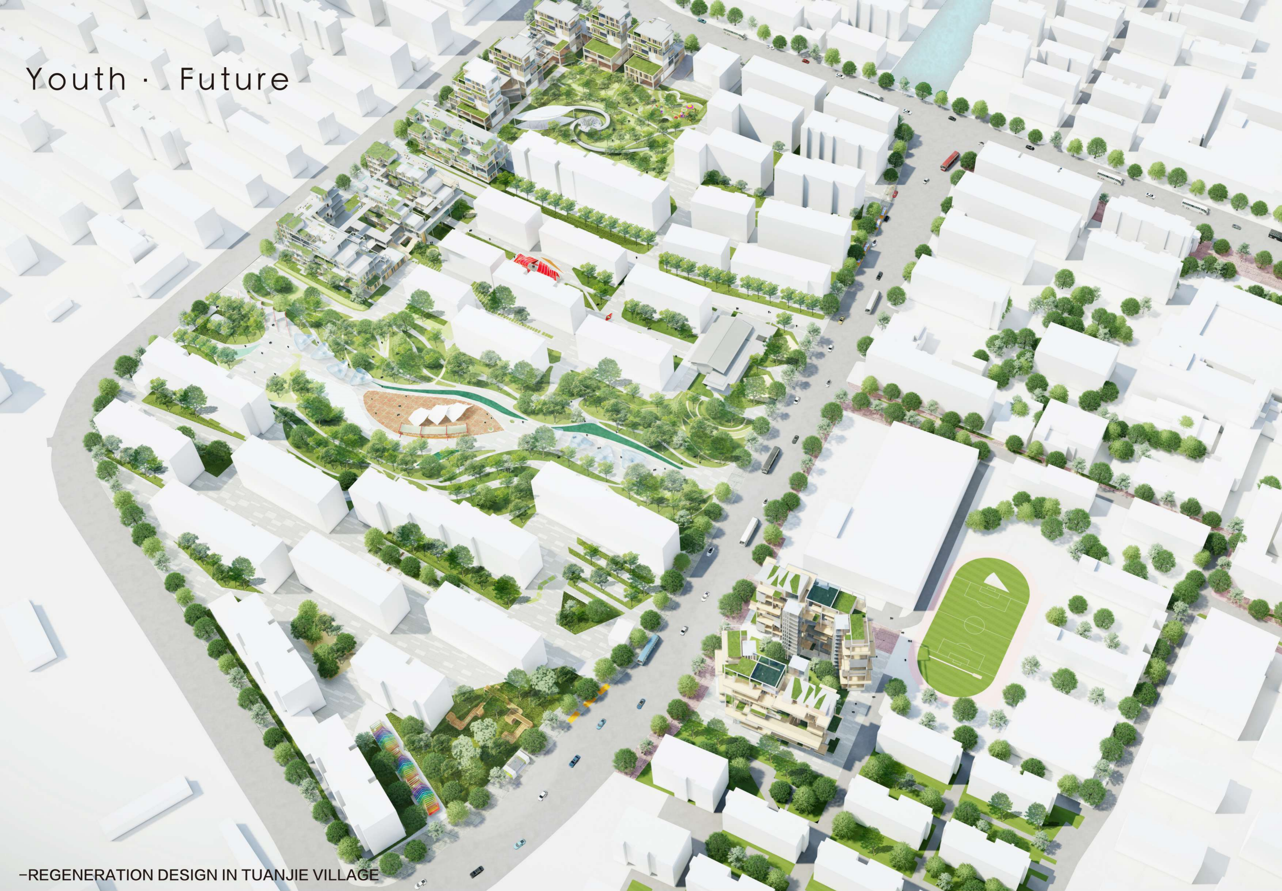
-REGENERATION DESIGN IN TUANJIIE VILLAGE